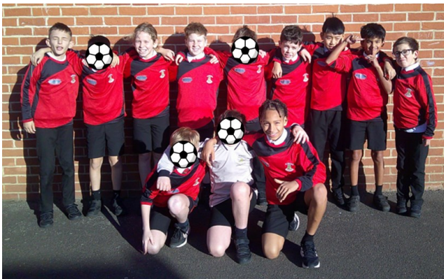
Year 6 Team