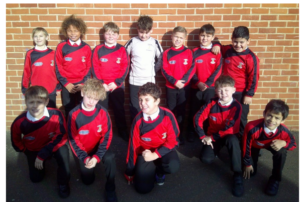
Year 5 Team