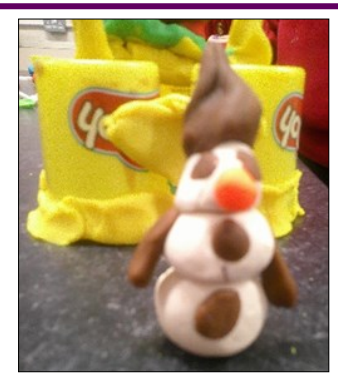
Key Stage 2 Playdough Club meet on a Monday after school. The children get to use their creativity and create models using their imaginations. They can chill with friends and share ideas and resources. A lovely way to unwind for an hour.